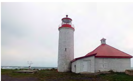
Nine Mile Point Lighthouse (1833). Canada's oldest continuously active Great Lakes lighthouse

Other important heritage lighthouses like Presqu'île Point (owned by the Ontario government), Salmon Point (privately owned) and Pigeon Island (surplus but not nominated under HPLA) are not included in these numbers.