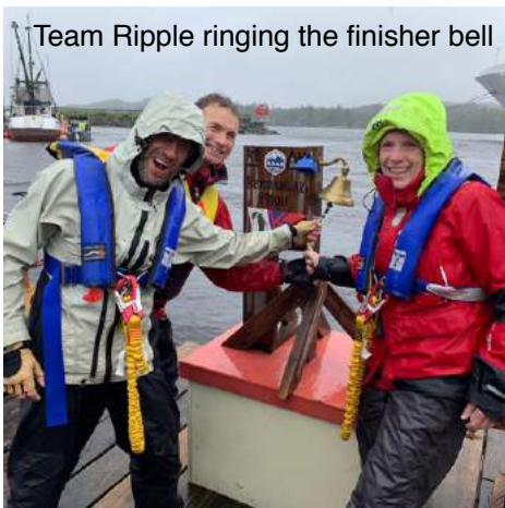
Team Ripple ringing the finisher bell