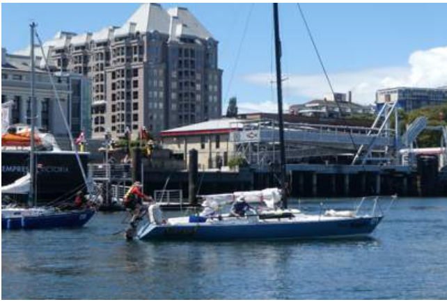
Pedalling out of Victoria Harbour after the Stage 2 start, on our way To the Bitter End.