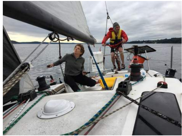
Light wind & nasty currents working our way up Campbell River.