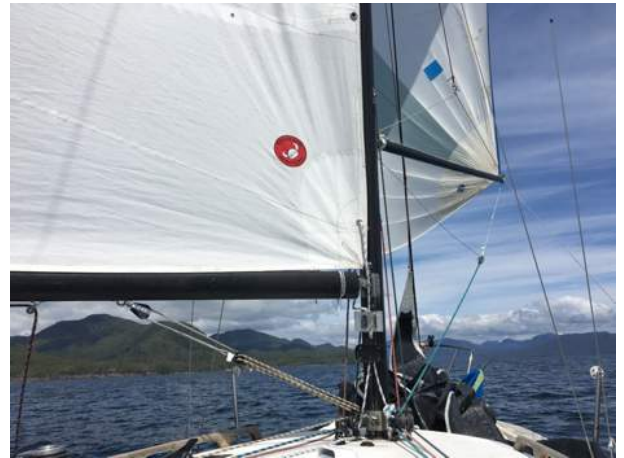
Clear skies, mountains, & smooth sailing along Finlayson Channel.