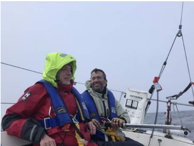
Wind, fog, rain & smiles in Gordon Channel.